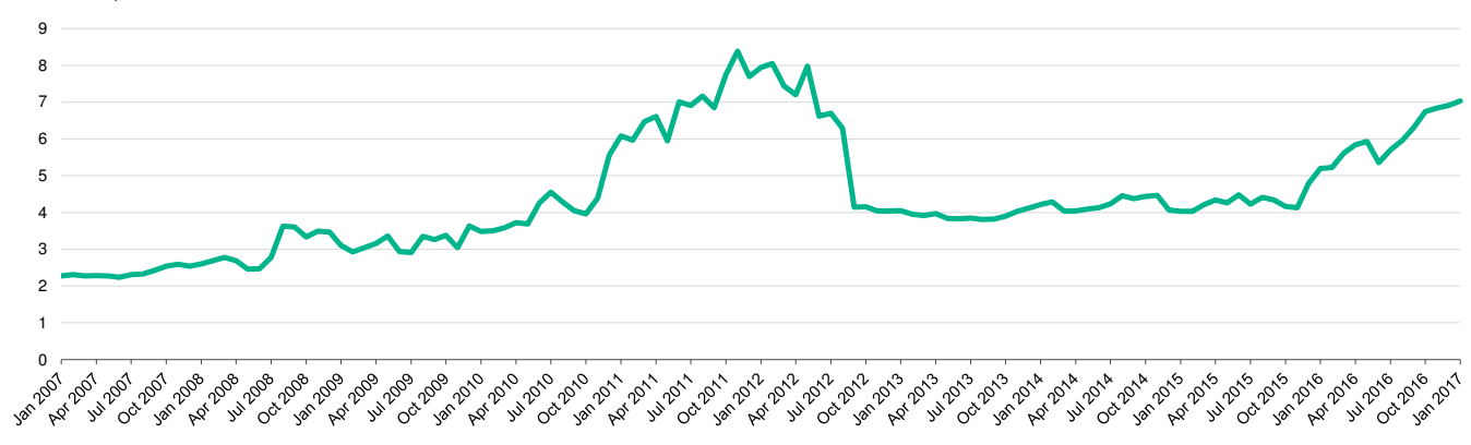
Exhibit 2 Iceland's Foreign Exchange Reserves (US$ Billions)